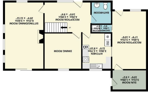
GROUND FLOOR: 83.3 sq.m. (897 sq.ft.) approx.

Which every attempt has been made to ensure the accuracy of the figures contained herein, measurement of doors, windows, rooms and other areas are approximate and no responsibility is taken for any error or omission on this account. The plan for building purposes only and should not used as such for any prospective purchaser. The architect, systems and appliances shown have not been tested and no guarantee as to their operation or efficacy can be given. Made with Metronix eCO2